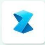
Synapse Data Science