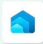
Synapse Data Warehouse